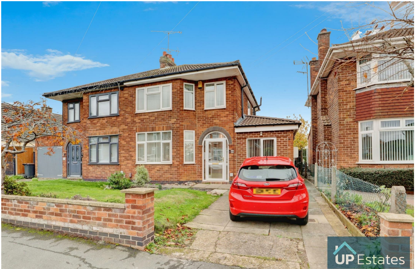
All Saints Road, Bedworth